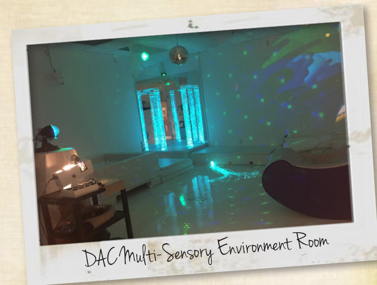
DAC Multi-Sensory Environment Room

Our sensory integration program provides an environment that can be controlled with either intensified or reduced stimuli to help a client feel safer and more secure. This is done with the use of special lighting, music, objects, vibration and projectors for visual stimulation. Both locations have a Multi-Sensory Environment room.