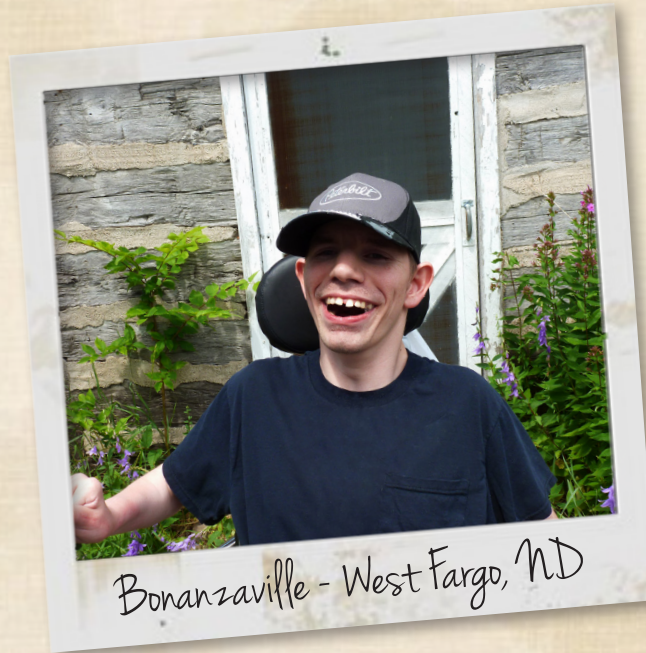
Bonanzaville - West Fargo, ND

We work on community sites or bring your work to our center! Skilled workers can meet your business needs. We excel in the quality completion of repetitive tasks that will free up your staff for other jobs and customer relations. We currently provide services in paper shredding, folding, stuffing and sealing envelopes, custom made plastic garbage bags and packaging and making fire starters. If you have other needs, just give us a call and we will see how we can help your business.