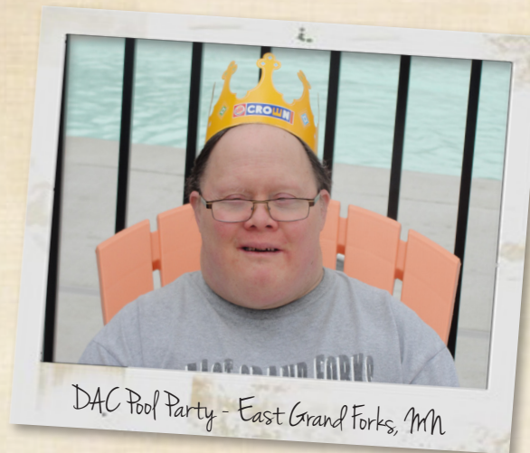
DAC Pool Party - East Grand Forks, MN